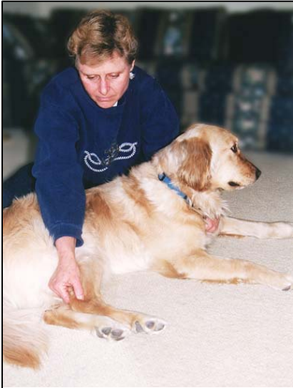
Acupressure Training

The term acupuncture is from the Latin, “acus” meaning ‘needle’ and “punctura” meaning ‘to prick’. Acupuncture, in its simplest sense, is the treatment of conditions or symptoms by the insertion of very fine needles into specific points on the body in order to produce a response. Acupuncture points can also be stimulated without the use of needles, using techniques known as acupressure, moxibustion, cupping, or by the application of heat, cold, water, laser, ultrasound, or other means at the discretion of the practitioner.